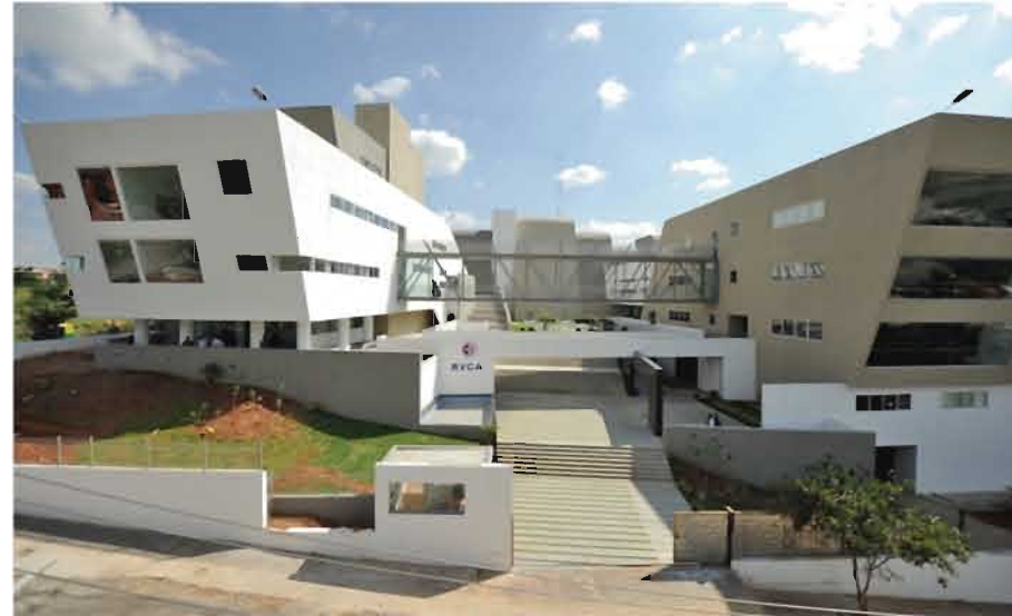
Route Map to RV College of Architecture